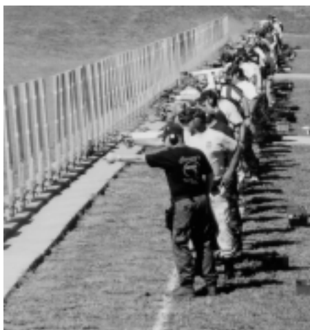
Officers shoot from seven yards during the 2000 National Police Shooting Championships.