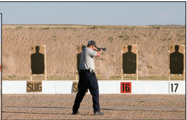
NPSC is truly an international competition. Competitors ventured to Albuquerque in 2006 from five foreign countries, including Canada, Venezuela, Russia, the Czech Republic, and Germany (pictured).