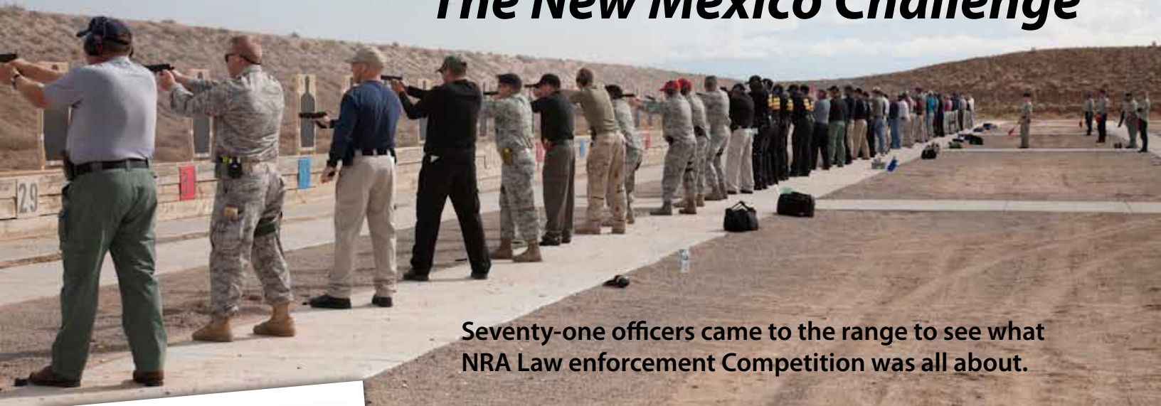
Seventy-one officers came to the range to see what NRA Law enforcement Competition was all about.

The officers were from diverse backgrounds: city police, sheriff deputies, and state police, several from Motor Transportation Unit and Air Force Security forces. The atmosphere was casual and relaxed.