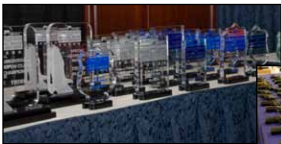
Valuable prizes and trophies will be awarded at the 2009 NPSC