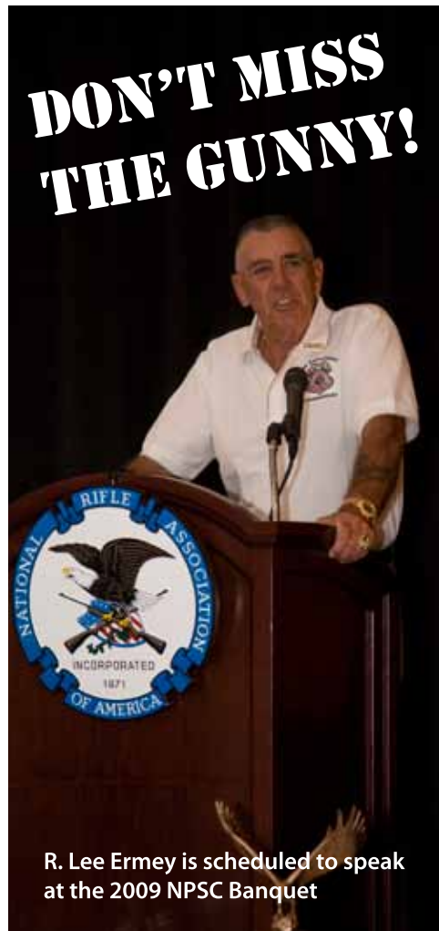
R. Lee Ermey is scheduled to speak at the 2009 NPSC Banquet

If you have not already planned to attend, please do so in a hurry – time is drawing near!