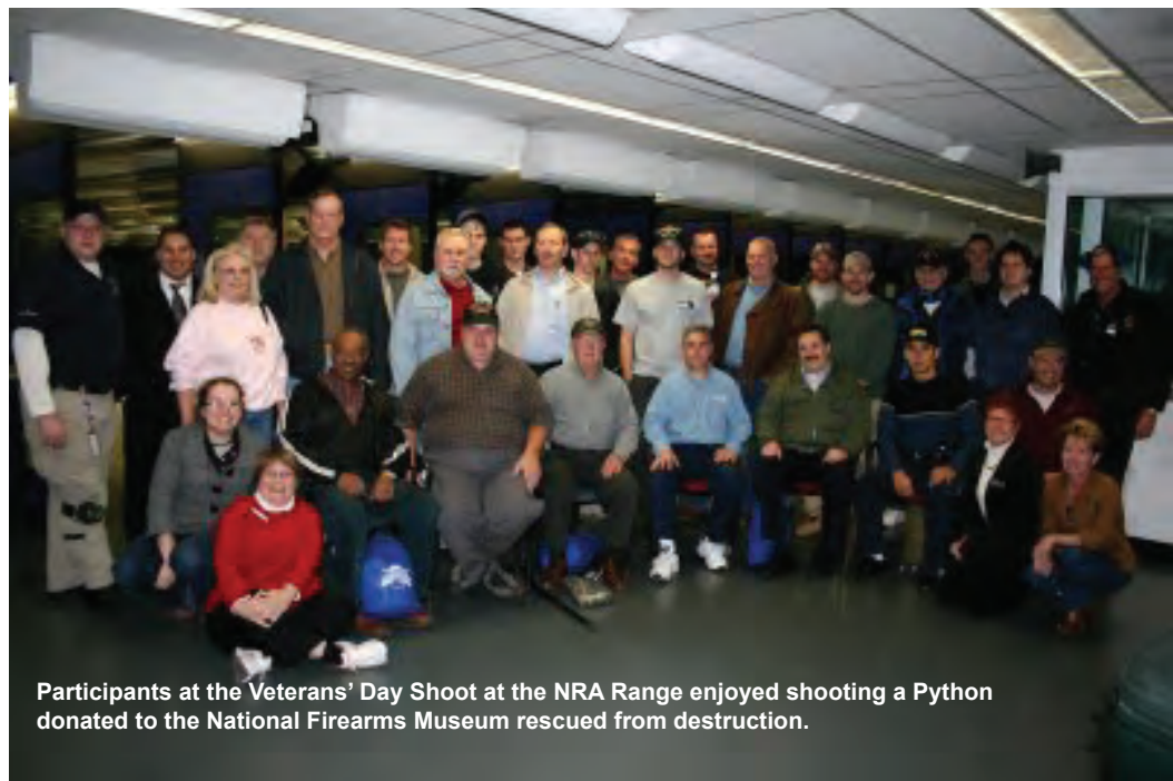
Participants at the Veterans' Day Shoot at the NRA Range enjoyed shooting a Python donated to the National Firearms Museum rescued from destruction.