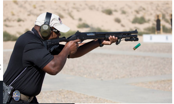
Above: The Shotgun Championships were the number-one entered event.

For more information on the results, visit our website at http://npsc.nra.org .