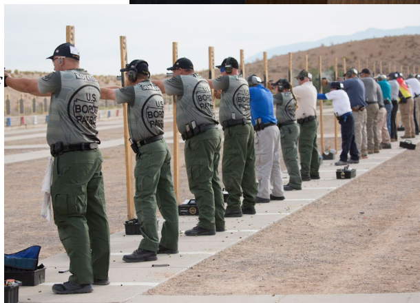
Below left: The Off-Duty Championship Match.