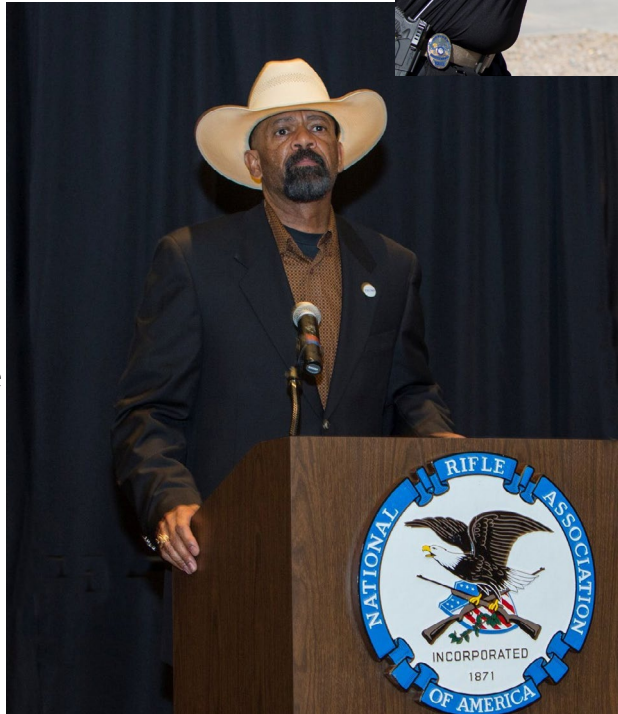
Left: Sheriff David A. Clarke, Jr., of Milwaukee County, Wisconsin, was the banquet's keynote speaker.