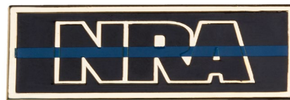
New "Thin Blue Line" Lapel Pin

See all of our products on the NRA's Program Materials Center,