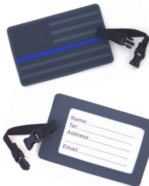
Luggage/Range Bag Tags